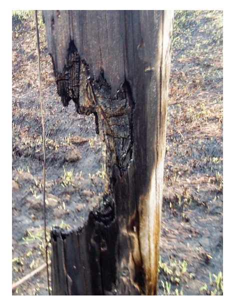
Before burning, check the property for electrical equipment and power poles to avoid damage and potential outages.

Burning or even scorching a pole may compromise the integrity of the structure. Power poles are treated with