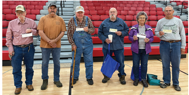
Six lucky members won bill credits during the annual meeting prize drawings.