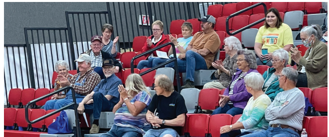
Some of the approximately 55 members and guests attending our annual meeting.

on the seven cooperative principles: voluntary and open membership; democratic member control; members' economic participation; autonomy and independence; education, training and information; cooperation among cooperatives; and concern for community.