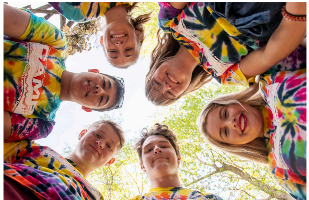
Whether you attend the Cooperative Youth Leadership Camp or Kansas Electric Youth (KEY) Leadership Conference, you'll be sure to create friendships to last a lifetime.