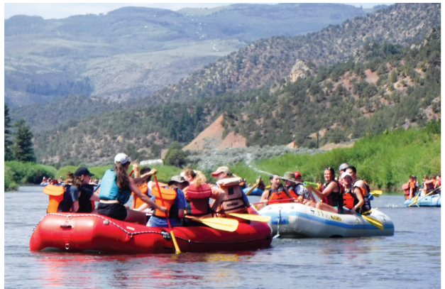
Each year, campers go rafting during Cooperative Youth Leadership Camp in Steamboat Springs, Colorado, which is scheduled for July 15-21, 2022.