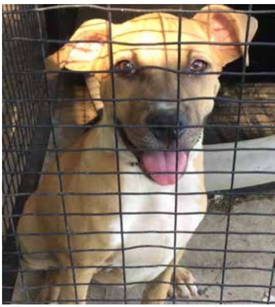
To learn more about Fredonia Pound Pals, follow them on Facebook and Twitter.